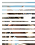
Gemini 17 weeks old Once a feral, now a playful boy who likes to climb