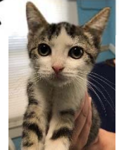
Ulysses 16 weeks old She's a blossomed wall-flower who survived a leg injury