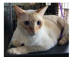
Norman 21 Months old Enjoys cuddles and making biscuits