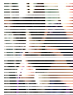
Sneezy 20 weeks old A Silly, fun, and clumsy boy