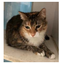
Emma P 4 years old She's an independent, loyal friend

If you are interested in adopting one of our “class acts,” contact us to set up a meet and greet and fill out an adoption application!