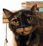
Emma G 7 year old Tortoise, a sweet gal that give kisses. But likes to be the one and only.