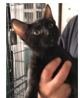
Sleepy 20 weeks old He's The Snuggler; a professional at relaxation