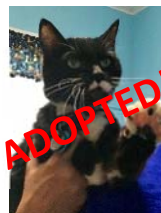
Groucho He loves to talk about your day