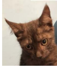
Jetta 5 weeks old A sweet, gentle, laid back girl

Our cats are highly educated in how to be your next great fur baby!