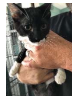
Happy 20 weeks old He's true to his name, and enjoys exploring