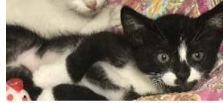
Dave Thomas 14 weeks old An energetic boy that loves to play chase